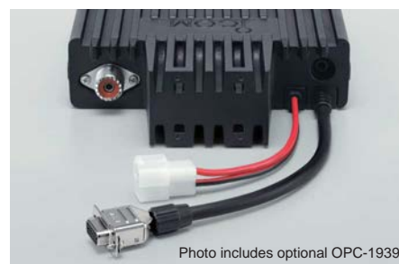
Photo includes optional OPC-1939

With the optional OPC-1939 D-SUB 15-pin ACC cable, the IC-F5023/H series can be programmed to control an operating channel from an external device (up to 16 preprogrammed channels). The ACC connector also provides an ignition sensing function, external PTT, PC command, horn honk, audio output and modulated signal input depending on programming.