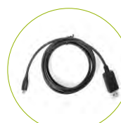
Programming Cable PC69