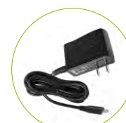
Micro USB Power Adapter (5V/1A)