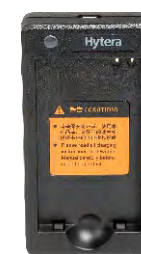
Rapid-Rate Charger (for Li-Ion Battery) CH10L20